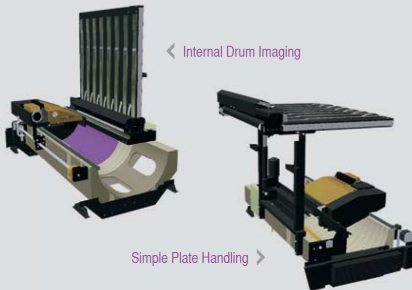
< Internal Drum Imaging

Python's high speed spinner is designed for fast imaging. Combined with easy plate handling, Python can output up to 20 B2 plates per hour, including plate loading and unloading time. Python can also optionally be configured to automatically unload plates into a plate processor for semi-automated production.