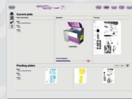
< Python Console Software

Using HighWater's Barcode Plate Requeue software, which adds a unique plate identification mark to each plate, users can easily retrieve jobs for re-output by simply scanning the barcode. Optionally combined with the powerful user oriented Cascade RIP providing real world workflow complete with hybrid screening, or renowned Navigator Harlequin RIP with either offering options including in-RIP trapping, imposition, soft proofing, ink control and more you'll have an unbeatably productive system geared to getting real world work on plate correctly, day after day.